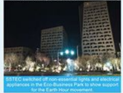
SSTECS switched off non-essential lights and electrical appliances in the Eco-Business Park to show support for the Earth Hour movement.

and appreciation of the Earth's rich and fragile biodiversity, thus strengthening their awareness of the need to protect biodiversity. This is the eighth year SSTECS has joined the global movement Earth Hour to signal its commitment to protect the environment. As