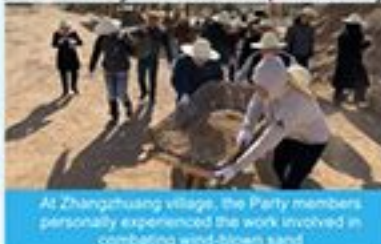
At Zhangzhuang village, the Party members personally experienced the work involved in combating wind-blown sand.