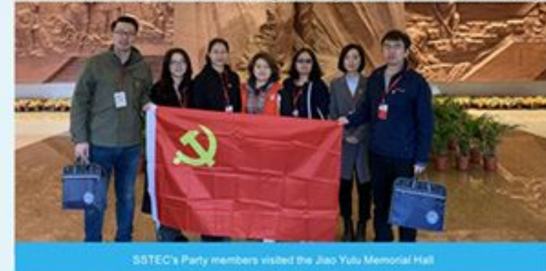
SSTECS's Party members visited the Jiao Yulu Memorial Hall.

From 10 to 14 of Mar, in line with arrangements made by CPC TECID Committee, 7 Party members from SSTECS's Communist Party branch visited Henan Province with 40 other Party members from CPC TECID Committee, to participate in the first edition of this year's training course for Party members, which revolved around the theme "Never Forget Why You Started and Forge