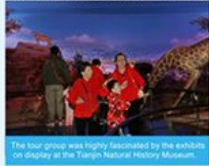
The tour group was highly fascinated by the exhibits on display at the Tianjin Natural History Museum.

The members of public were invited by SSTECS to tour the Tianjin Natural History Museum with their family members after they had answered all questions correctly in a quiz on biodiversity that was earlier posted on SSTECS's official WeChat account. The tour, which included exhibits on the evolution of the natural world over the 3.8 billion years of the Earth's history as well as displays of more than 200 rare wild animal specimens, deepened the tour group's understanding