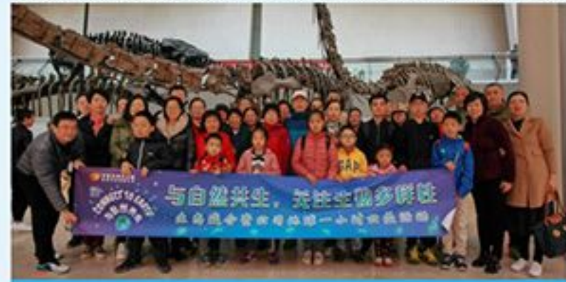
The tour group gathered for a commemorative photo at the Tianjin Natural History Museum.

and appreciation of the Earth's rich and fragile biodiversity, thus strengthening their awareness of the need to protect biodiversity. This is the eighth year SSTECS has joined the global movement Earth Hour to signal its commitment to protect the environment. As