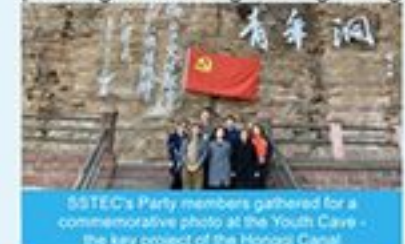
SSTECS's Party members gathered for a commemorative photo at the Youth Cave - the key project of the Hongqi Canal.

The first stop of the trip was Lankao County, where the "Jiao Yulu Spirit" originated. The Party members visited the Jiao Yulu Memorial Hall, Memorial Park, East Dam of the Yellow River, Zhangzhuang village and other places. They acquired a full understanding of the spirit of Jiao Yulu's inspiring efforts in leading the people of Lankao to combat the "three threats of nature" (wind-blown sand, saline-alkaline land and waterlogging). The Party members also learnt about how Jiao Yulu had served the people wholeheartedly and had spared no effort in doing so till his passing. At Zhangzhuang village, the Party members personally